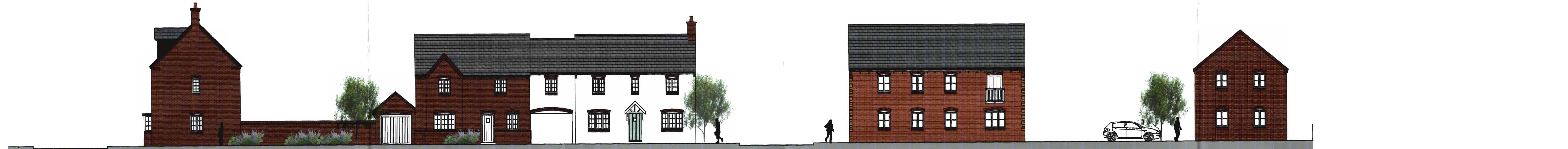
Plot 34 Plots 35 & 36 Plots 40 - 43 Plots 45 & 46