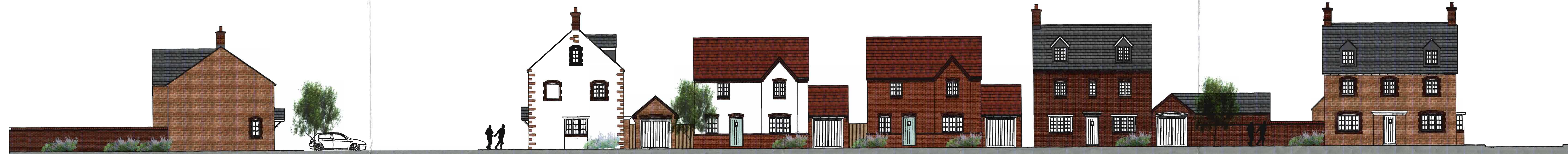
Plot 12 Plot 74 Plot 75 Plot 76 Plot 77 Plot 79