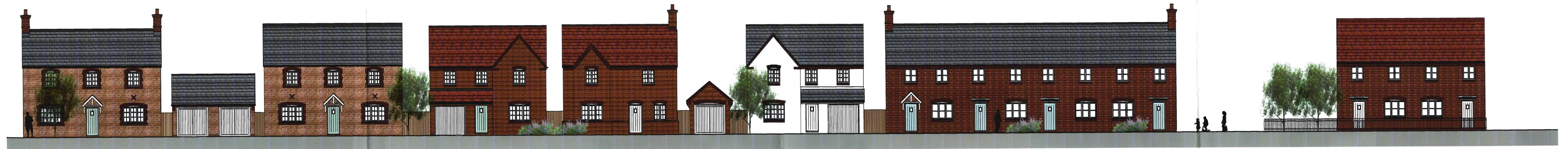
Plot 1 Plot 2 Plot 3 Plot 4 Plot 5 Plots 6 - 9 Plots 10 & 11