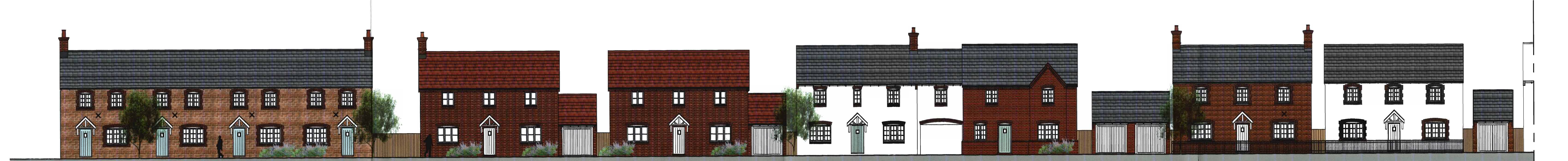
Plots 12 - 15 Plot 16 Plot 17 Plot 18 Plot 19 Plot 20 Plot 21